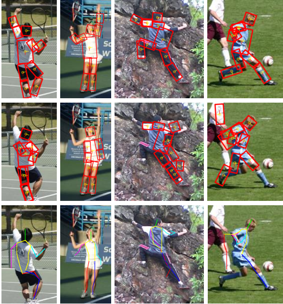
Figure 2. Sample pose estimation results on the LSP dataset obtained by our method (row 1), PS [3] and the method of [26] (row 3). Modelling long-range part dependencies by our method results in better performance on highly articulated people.