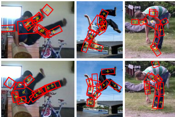
Figure 3. Typical failure cases on the LSP dataset. Shown are the results by our method (row 1) and PS [3] (row 2).

estimated values are w_p = 0.1 and K = 12 . Note that the value of w_p increased with respect to the LSP dataset, which results in a stronger influence of the poselet features on the final solution. This could be due to a larger variability of people poses on the LSP dataset compared to IP (see [15] for the discussion and comparison of the two datasets).